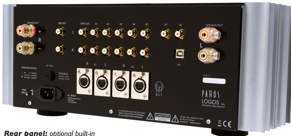
Rear panel: optional built-in DAC gives digital input connectivity

Listening initially to the amplifier in its conventional analogue-input mode, the Logos Mk II was very impressive on the classic jazz album Kind Of Blue . When playing the same album but using the CD player's coaxial digital output connected to the Logos amplifier's digital input, it was clear that Pathos has provided a built-in DAC here that would