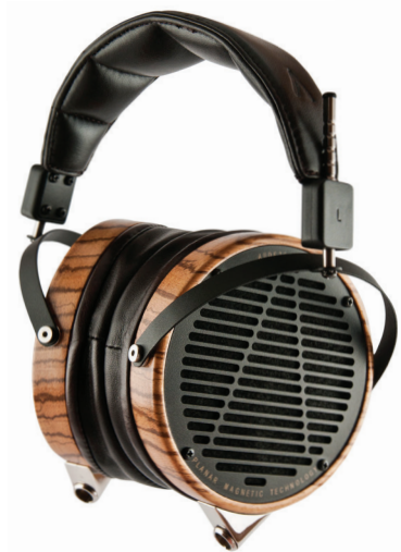
Zebrawood / Leather

Our newly-developed ultra-thin diaphragm is significantly thinner than other planar designs. It's suspended between arrays of magnets and tensioned with extreme precision for an even distribution of force across its surface.