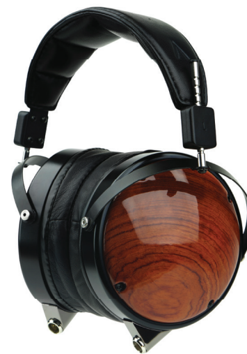
Lambskin / Bubinga

The original, a beautiful, seductive sound encompassing the same powerful, differentiated bass as all Audeze headphones, transitioning to a gorgeous and tonal-rich midrange, with a beautiful, warm and emotive treble region. It takes a real effort not to enjoy music on these headphones.