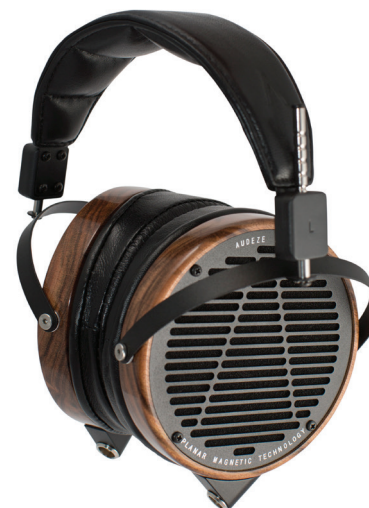
Rosewood / Leather

Silky, refined sound, a wide, enveloping out-of-the-head soundstage that's delivering intimate club sound or concert-level dynamics. The bass is powerful, controlled and consistent, the midrange engagingly attractive, with a golden, burnished and beautifully balanced treble region. The experience is magnetic!